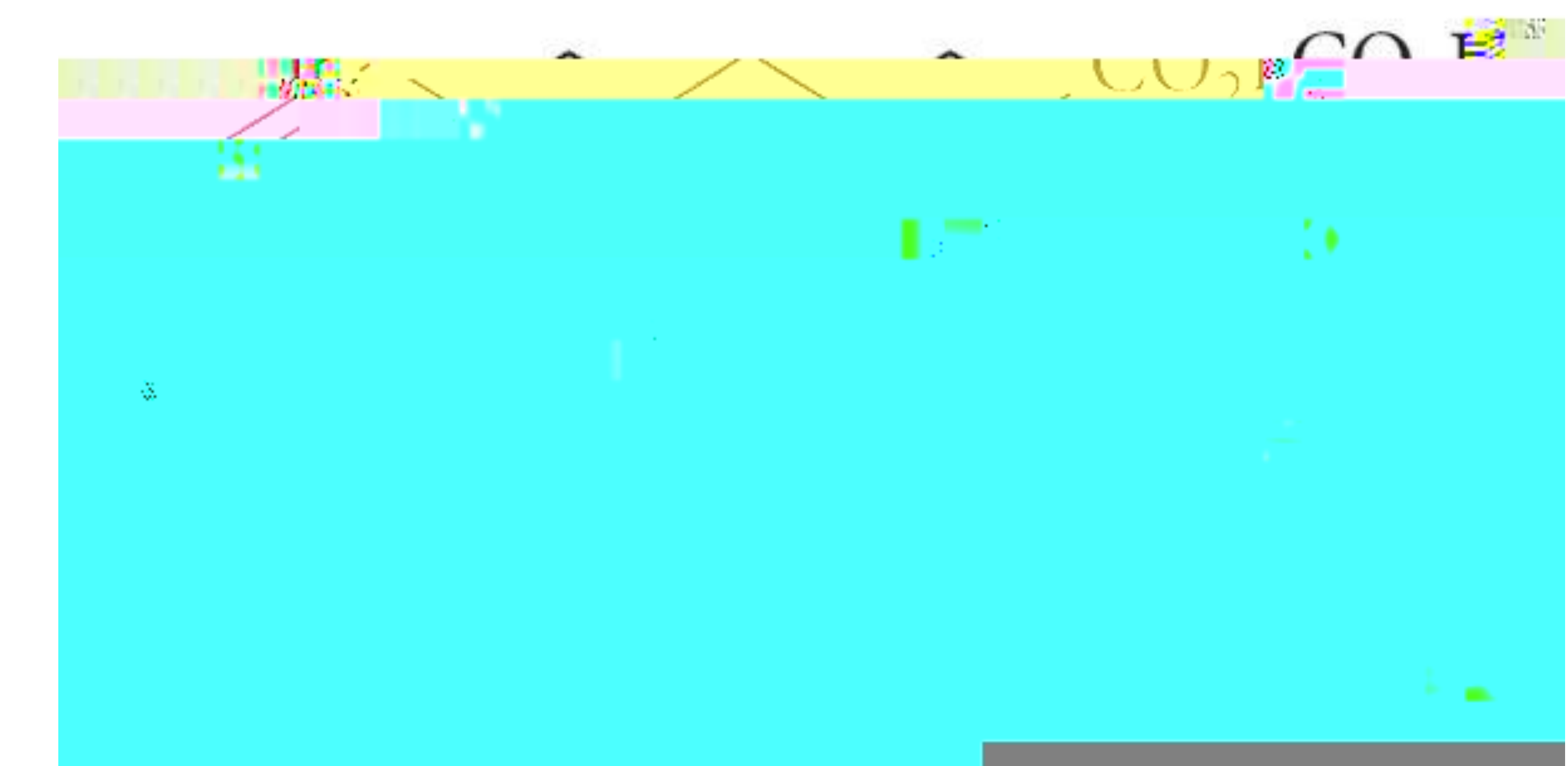
Figure 3. Levodopa chemical structure. (Abdoon, 2022)

Due to these factors IR-CL seems to be the better option in early Parkinson's Disease and ER-CL for later.