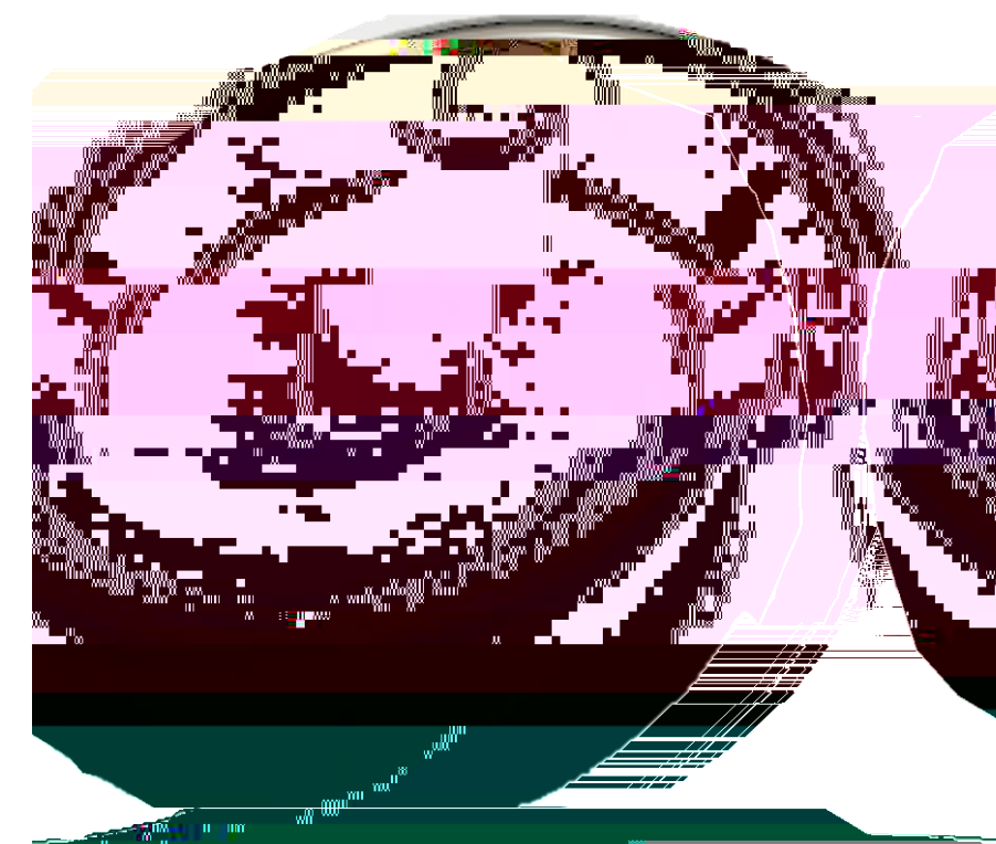
Figure 3: Initial "Tippe Top" designs

Idea Three: a "Tippe Top" -Initially not very cost effective -3 different masses -Shifted the center of mass -2 different types of material